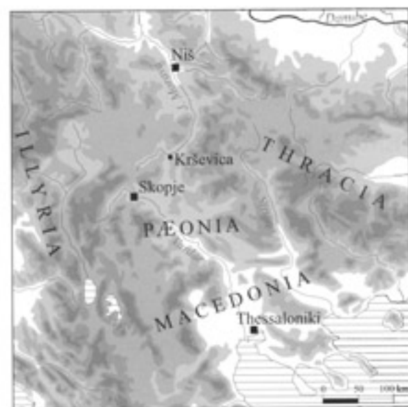
Fig. 1. Map (drawn by S. Tripković) Fig. 2. "Stone quarry" and "rampart" with added structure in 2003 Сл. 1. Карта (израдио С. Трипковић) Сл. 2. „Каменолом“ и „бегем“ са призидањем трајевином 2003