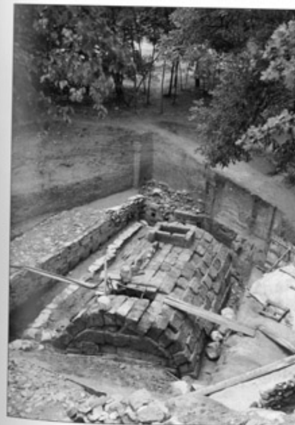
Fig. 15. View of the complex in 2011 Сл. 15. Поглед на комплекс 2011

On the other hand, barrel vaults as architectural elements in fortifications and public buildings are not very frequent in the Greek cities. 24 In one study dealing