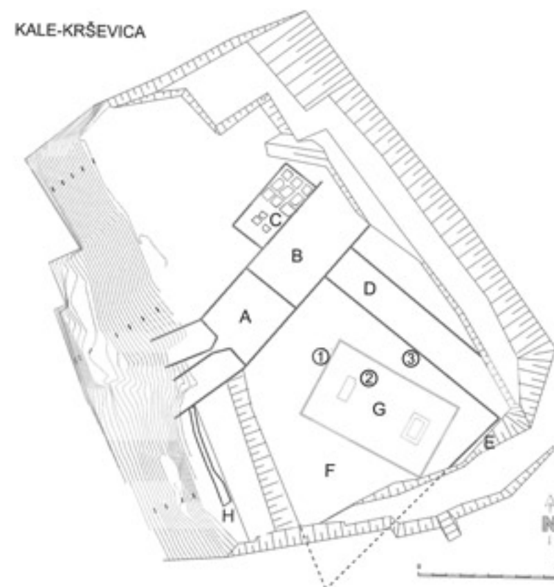
Fig. 13. Plan of hydrotechnical complex: A – upper platform with walls, B – lower platform, C – “tower”, D – east wall, E – south wall, F – water collection basin, G – water intake facility, H – wall of broken stone, I – stone block in front of north structure wall, 2 – bucranium, 3 – pottery (drawing A. Nikolić and A. Subotić)