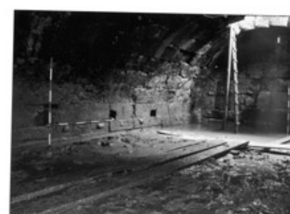
Fig. 7. Structure interior in 2008 (photo A. Đorđević)

Сл. 6. Источни зид са грађевином 2010 (фото А. Ђорђевић) Сл. 7. Унутрашњост грађевине 2008 (фото А. Ђорђевић)