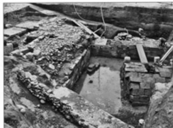
Fig. 5. Building complex in 2008 (photo A. Đorđević)

Сл. 4. Велика платформа са источним зидом и грађевином са бачвастим сводом 2008 (фото А. Ђорђевић) Сл. 5. Потлед на комплекс 2008 (фото А. Ђорђевић)