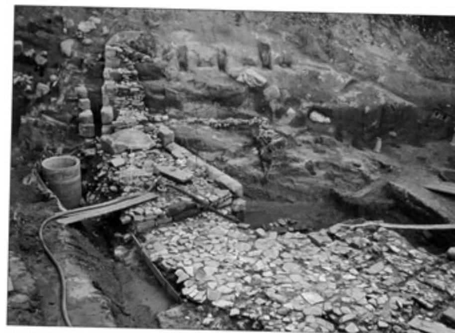
Fig. 3. View to the north section of the site in 2006 Сл. 3. Поглед на северни гео локалитет 2006

trench 3 x 6 m in size large stone blocks, which we explained as rampart were encountered in the south profile at the depth of around 1.5 meters, and next to the profile were recorded the remains of some structure built of broken stone. Under the fourth row of stone blocks and at the depth of almost three meters the water appeared (Fig. 2). 7 From that moment all further excavations in this section of the site were possible only with permanent use of the water pumps. In the campaigns, which ensued it became clear that rather deep under the grassland and fields in the layers with water and mud there are walls, buildings, various structures and other archaeological finds covered with thick sand deposits of Krševica river and the material washed away from the nearby slope.