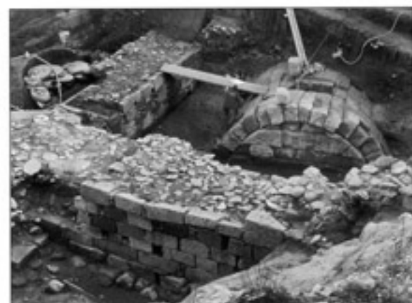
Fig. 4. Large platform with east wall and structure with barrel vault in 2008