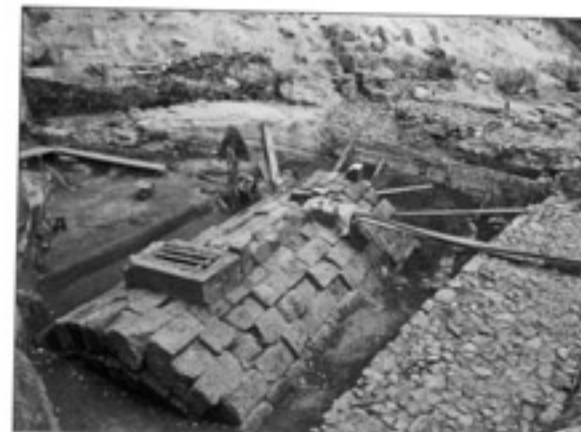
Fig. 6. East wall with structure in 2010

The size of this structure of rectangular plan is 10 x 6 m. It was built of large ashlar of tuff that are exception-