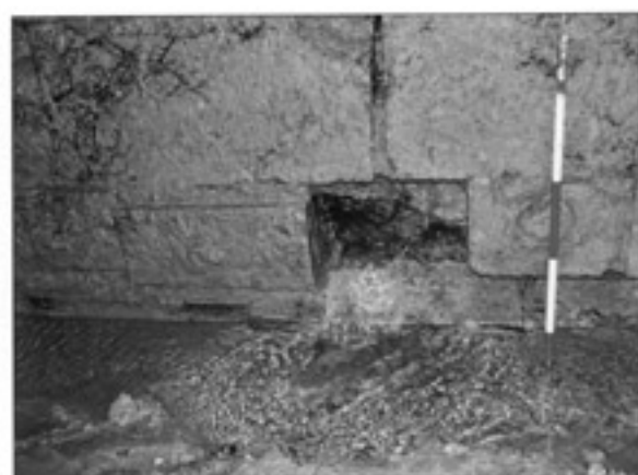
Fig. 8. Apertures in the structure interior and water level in 2008