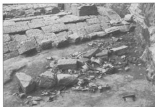
Сл. 12. Посуде уз источни беодем 2009